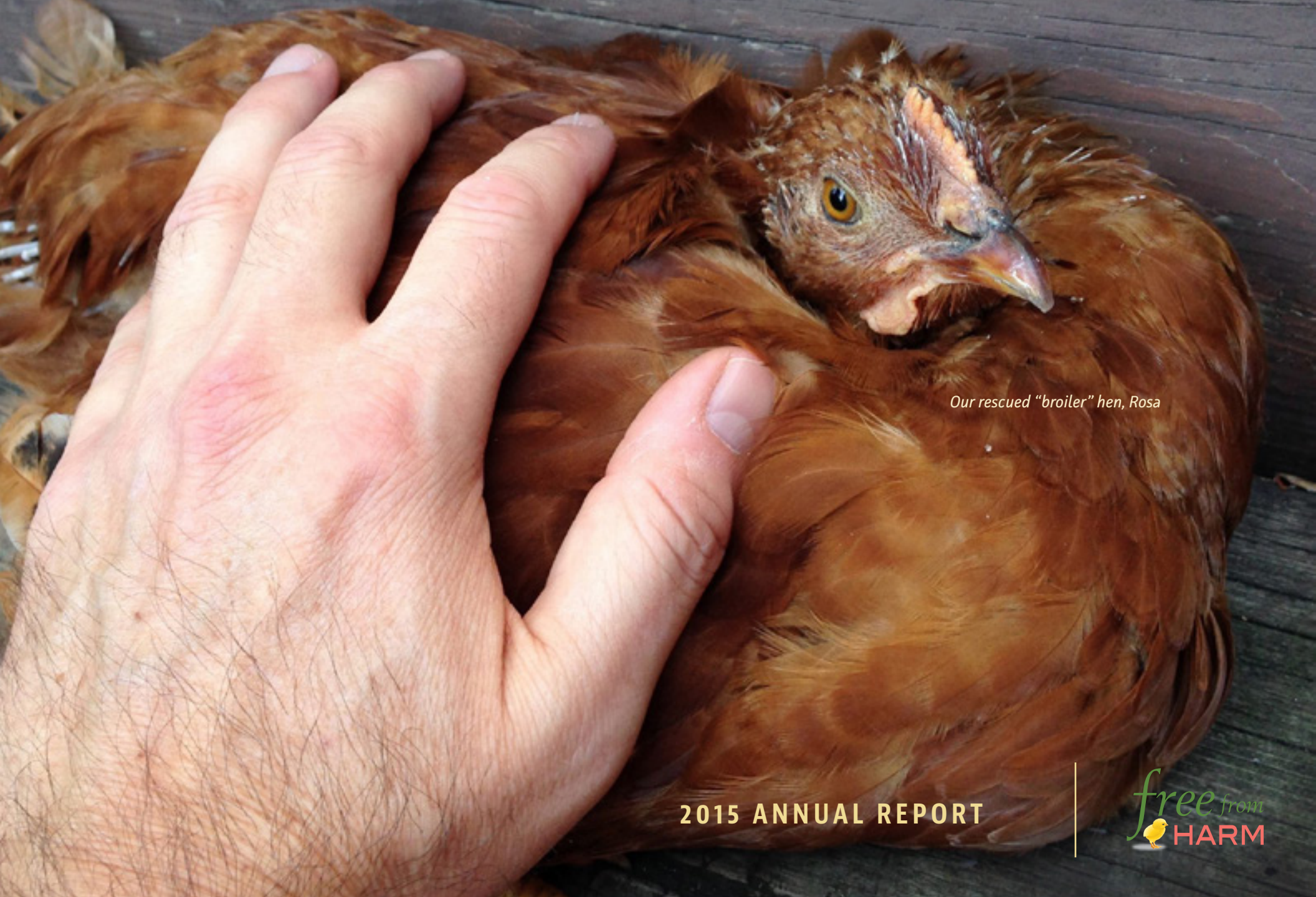
Our rescued "broiler" hen, Rosa